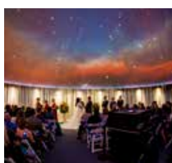
Dave Zerbe Studio of Photography

This exhibition couldn’t be more timely and we’re confident that school groups, scouts, and families will want to check out the many exciting components of the exhibit and then head over to the Neag Planetarium for more “out of this world” learning through our changing schedule of immersive shows, including one specifically matched with the exhibit, also called Astronaut! We’ll even be hosting astronaut-themed birthday parties and educational events throughout the spring so there are plenty of opportunities for the entire family to come to RPM to learn, explore, and be inspired. Find out more about all of these experiences in the several articles in this issue of Museum Road , and online at readingpublicmuseum.org