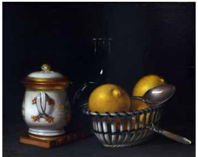
Raphaelle Peale (American, 1774-1825), Lemons and Sugar , c. 1822, oil on panel, Gift, Anonymous, 1946.150.1.

The son of prominent portraitist and museum founder Charles Willson Peale, Raphaelle Peale is credited with introducing the genre of still life into the mainstream of American art in the early 19th century. As such, Lemons and Sugar is recognized as one of his best works in the still life genre. Peale's treatment of the soft, diffused light on the objects and the contrast of the shadows behind make this a very interesting piece, and the masterful brushstrokes fade right into the highlight, shadow, and texture of the objects. As a significant piece of American art, this painting has been exhibited all over the country, and will now be making its first voyage overseas.