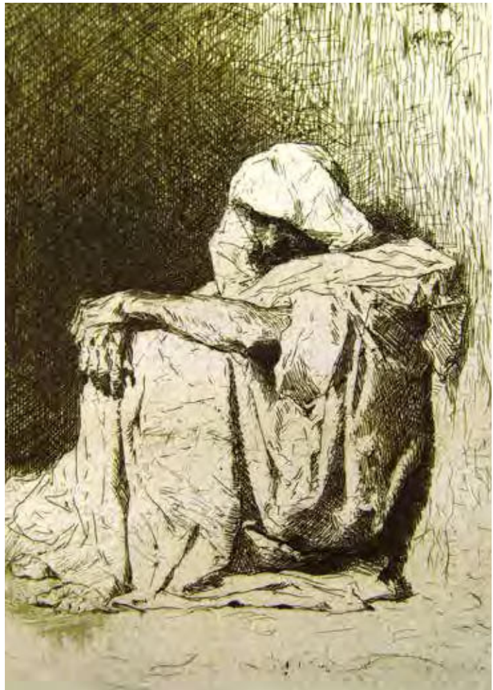
Mariano Fortuny y Carbó, Spanish, 1838 – 1874. Arabe Assis (Seated Arab) c. 1863 – 1867, etching, Museum Purchase, 1924.415.1.

This unique exhibition features a group of more than 30 etchings by Spanish painter and etcher, Mariano Fortuny (Spanish, 1838 – 1874) and his contemporaries. One of the leading artists of his day, working in both Paris and Rome, the artist achieved international renown in the second half of the 19th century. The artist often explored the theme of Orientalism (depiction of Middle Eastern, South Asian, and East Asian cultures) and the romantic exotic, drawn from trips to North Africa, including time in Tangier during 1859-60 during the Spanish-Moroccan War. Fortuny was an innovator in painting, watercolor, and etching, and this exhibition will include several works in those mediums. His distinctive and brilliant use of etching as an independent genre, with a unique freedom of line and expression, made him one of the most important and influential graphic artists of his time. All of the works are drawn from the collection at the Reading Public Museum.