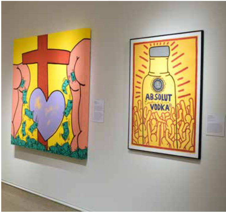
Gallery installation at the Reading Public Museum.