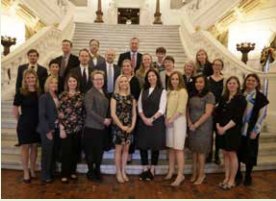
Group photo of Museum representatives at the Art Bridges + Terra Foundation Initiative Announcement on the Pennsylvania Capitol Steps, Harrisburg, April 29, 2019.

The Museum is honored to be part of an exciting new initiative funded by Art Bridges (Bentonville, Arkansas) + Terra Foundation (Chicago, Illinois) and anchored by the Philadelphia Museum of Art. The new initiative supports multi-year institutional partnerships that engage local communities with outstanding works of American art. Sharing collections and resources, these collaborative partners create a series of exhibitions that are content rich, include in-depth educational and interpretive material, and are designed to expand audiences through innovative programming.