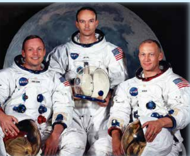
Apollo 11 crew from left to right: Neil Armstrong, Michael Collins and Edwin "Buzz" Aldrin.

July 20 marks the 50 th Anniversary of the lunar landing! To celebrate, The Museum is showing a new planetarium show all summer that recounts the amazing journey — Apollo 11: Man's First Step Onto The Moon . Find out why the U.S. put so many resources into getting three test pilots and astronauts to the Moon, how they did it, what it looked like, and what they did once they got there. Follow the history making voyage of Apollo 11 at the Neag Planetarium this Summer! See the show every Weekday & Sunday at 4 p.m., July – August.