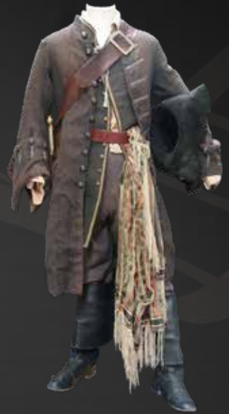
Pirates of the Caribbean: The Curse of the Black Pearl (2003), 18th-century costume, Johnny Depp as Captain Jack Sparrow, Costume Design by Penny Rose, Best Costume Award from the Academy of Science Fiction, Fantasy and Horror Films.

Presented by Exhibits Development Group in cooperation with Cosprop Ltd., London, England