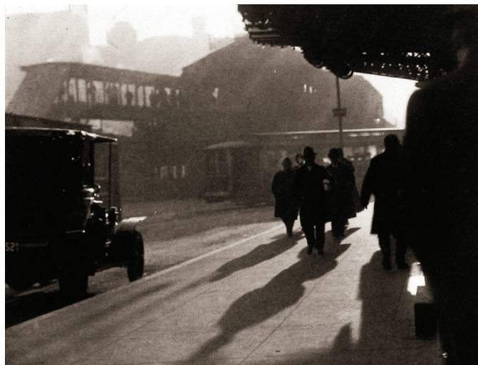
FAR LEFT: Dorothea Lange, Migrant Mother, Nipomo, California, 1936 , photogravure; printed by Aperture. CENTER TOP: Karl Struss, Shadows, New York, 1909 , platinum print. CENTER BOTTOM: Gallery installation at Vero Beach Museum of Art. BOTTOM RIGHT: Gallery installation at Massillon Museum, Massillon, OH.