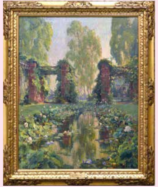
Colin Campbell Cooper; (American 1856 – 1937), The Lotus Pool, El Encanto, Santa Barbara , c. 1921-22, oil on canvas, Museum Purchase, 1922.163.1

This grant will help support educational programming in conjunction with Across the Atlantic: American Impressionism through the French Lens , which includes a two-day symposium for the representatives from the six museums that are borrowing the show once it begins its tour early next year. RPM will be welcoming museum executives from Louisiana, Florida, Iowa, Texas, North Carolina, and Arkansas, all eager to not only visit the show while on view in our American and European Art Galleries, but also participate in meaningful discussion about how to uniquely engage their audiences with Across the Atlantic while on display at their venues. In addition, each museum will have the opportunity to apply for funding from Art Bridges to support their individual projects and programs related to the exhibition. We are anticipating a fantastic few days, filled with great conversation, learning, and the building of new relationships. And the best part – a gathering like this has been made possible by YOUR museum! The scope of RPM's collection not only earned us this grant, but is also helping us make our mark in the world of American Art. Stay tuned to hear how the symposium went, but until then, please come out and take part in all the wonderful programs made possible by this grant; a speaker series, childrens programming, and a plein air painting workshop, just to name a few! Check our website for more details.