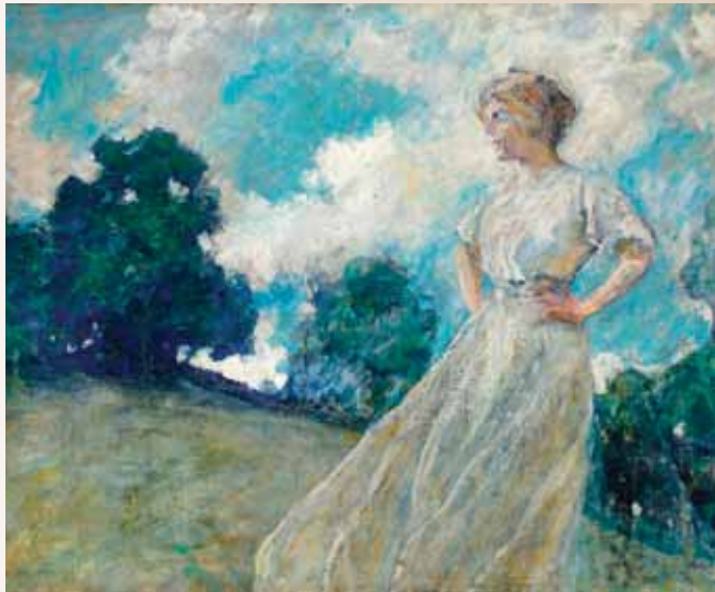
Robert Lewis Reid, (American, 1862 – 1929), Summer Breezes , c. 1910 – 1920, oil on canvas, Museum Purchase

September 24, 2011 through January 29, 2012