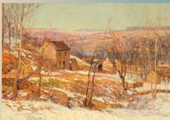
Edward Willis Redfield, (American, 1869 – 1965), Winter in the Valley , oil on canvas, Museum Purchase

Free with Museum admission OR Lunch & Lecture cost: $5 for Members/$10 for Non-Members